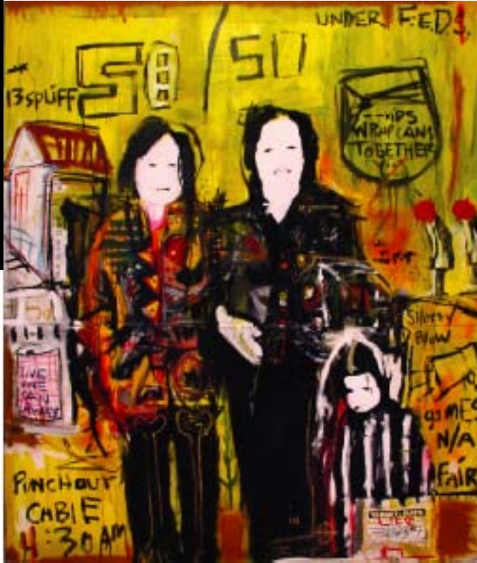
ABOVE: Von Kommanivanh, 13 Spliffs, 59" x 70.5", oil on canvas, 2003.

118 N. Peoria St., 2nd Floor Chicago, IL 60607 p 312/829.3312 — f 312/829.3316 T — SA 10:30–5:30 www.walshgallery.com